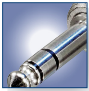
3 pole plug